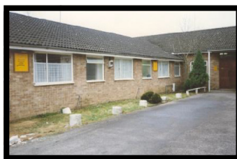
Bungalow (1972 - 1997)