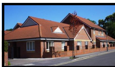
Hazeleigh Medical Centre (1998 - Current)