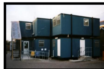
Portacabins (1997 - 1998)